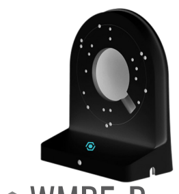
• WMB5-B WALLMOUNT BRACKET