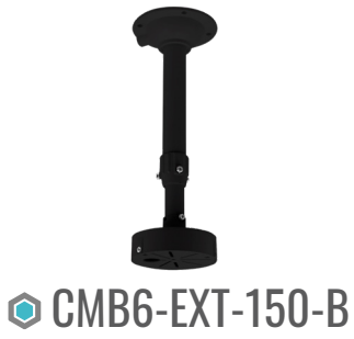
EXTENDABLE CEILING MOUNT BRACKET