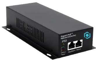
INJPOE90W 90 WATTS POE INJECTOR