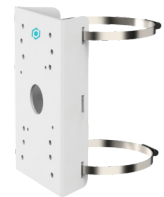
PMB6 POLE MOUNT BRACKET