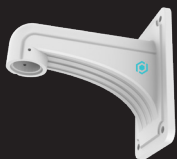
WMB6 WALLMOUNT BRACKET