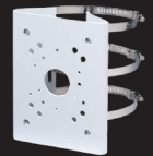
PMB6 POLE MOUNT BRACKET