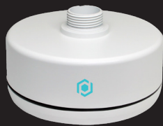
CMB6-G CEILING MOUNT