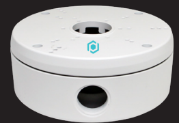
EB3BASE3 JUNCTION BOX