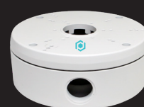
EB3BASE3 JUNCTION BOX