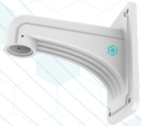
WMB6 WALLMOUNT BRACKET