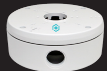
EB3BASE3 JUNCTION BOX