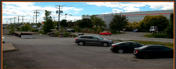
ANOTHER GSD CAMERA WITH A 2.8MM LENS