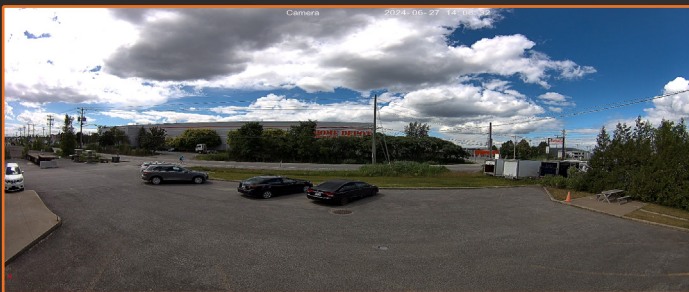
XB7FPAN20IP8MP-AI 180° PANORAMIC VIEW