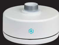
CMB6-G CEILING MOUNT