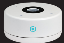
EB3BASE4 JUNCTION BOX