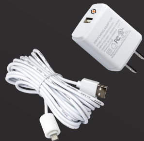
PWR-WL5V-2A POWER CABLE