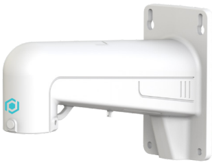
WMB8 WALLMOUNT BRACKET