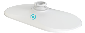
DBASEX-P PENDANT FOR DBASEX