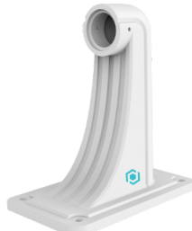
WMB6 WALLMOUNT BRACKET