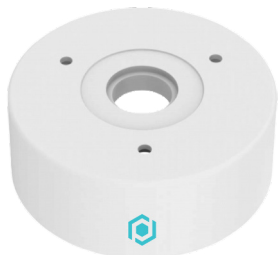
D2BASE1 JUNCTION BOX