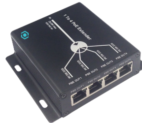
EXT-4POE 4 PORTS POE EXTENDER