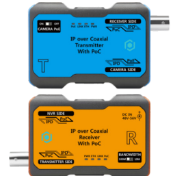
IPCOAX-300M IP OVER COAX EXTENDER