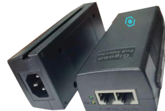
INJPOE25W 25 WATTS POE INJECTOR